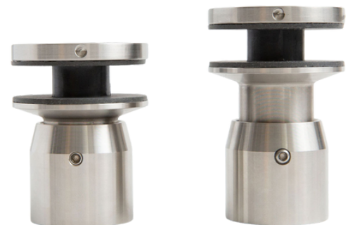
Adjustable Stand-off contracted (L) and expanded (R)