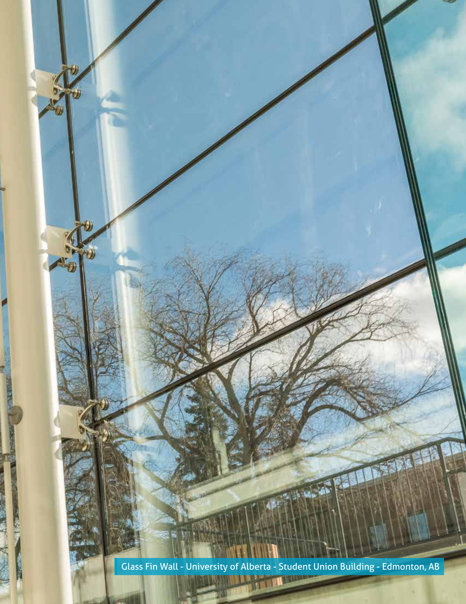
Glass Fin Wall - University of Alberta - Student Union Building - Edmonton, AB