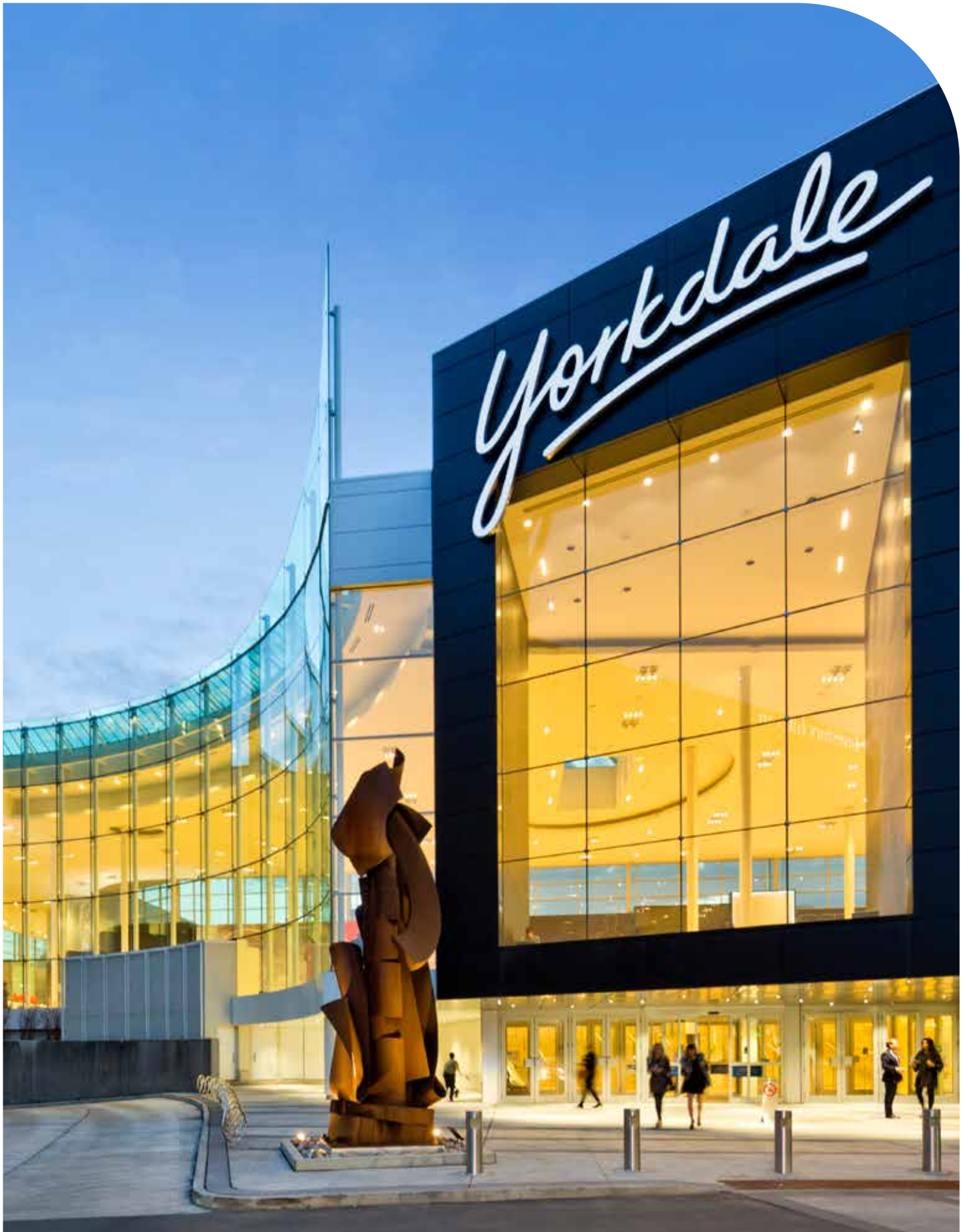
No Hole in Glass Walls - Yorkdale Mall - Toronto, ON