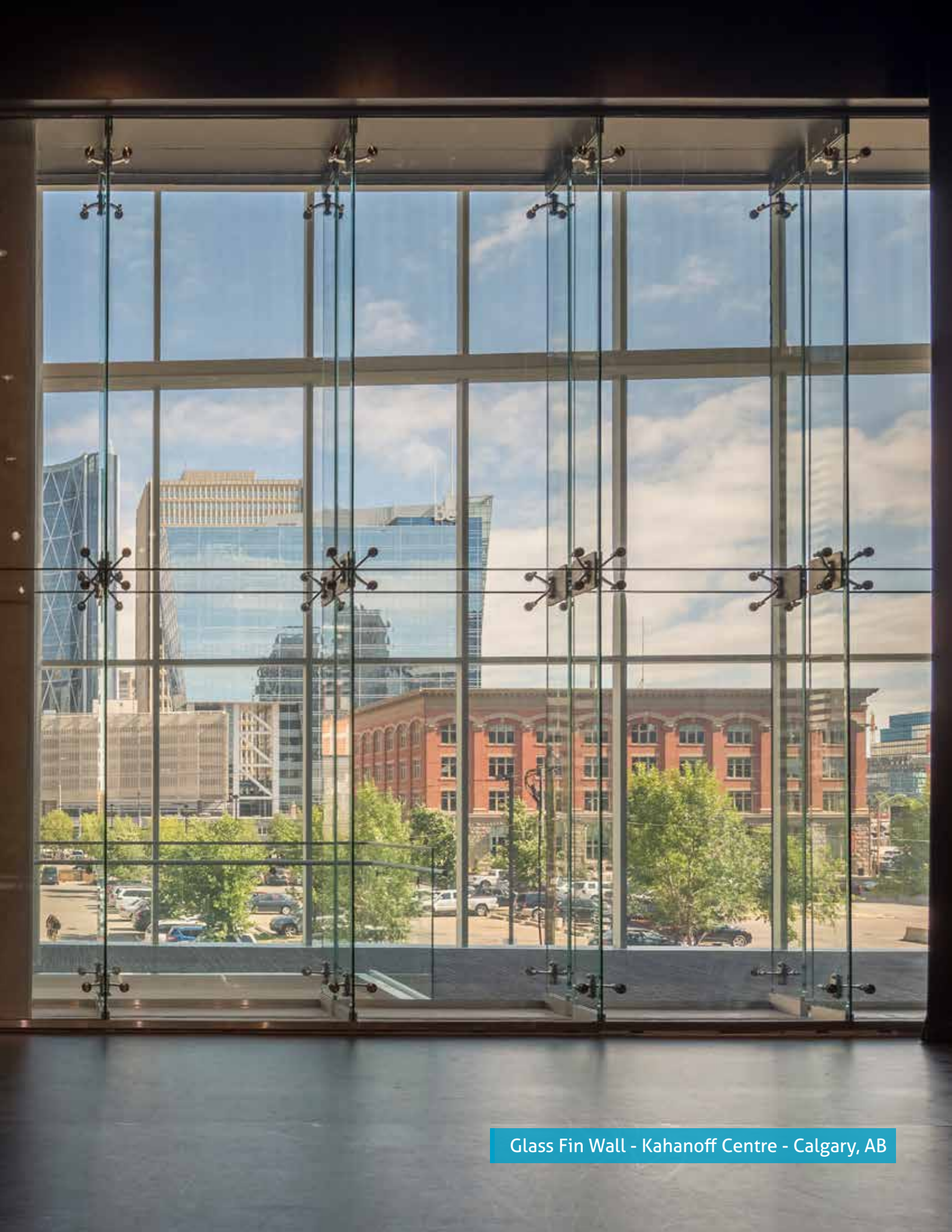
Glass Fin Wall - Kahanoff Centre - Calgary, AB