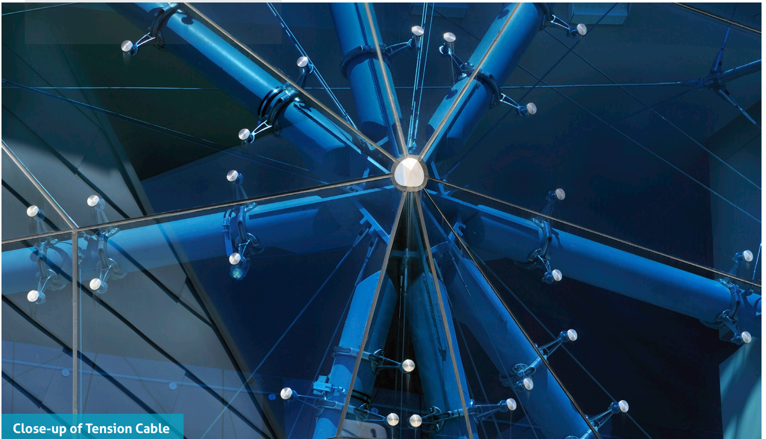
Close-up of Tension Cable