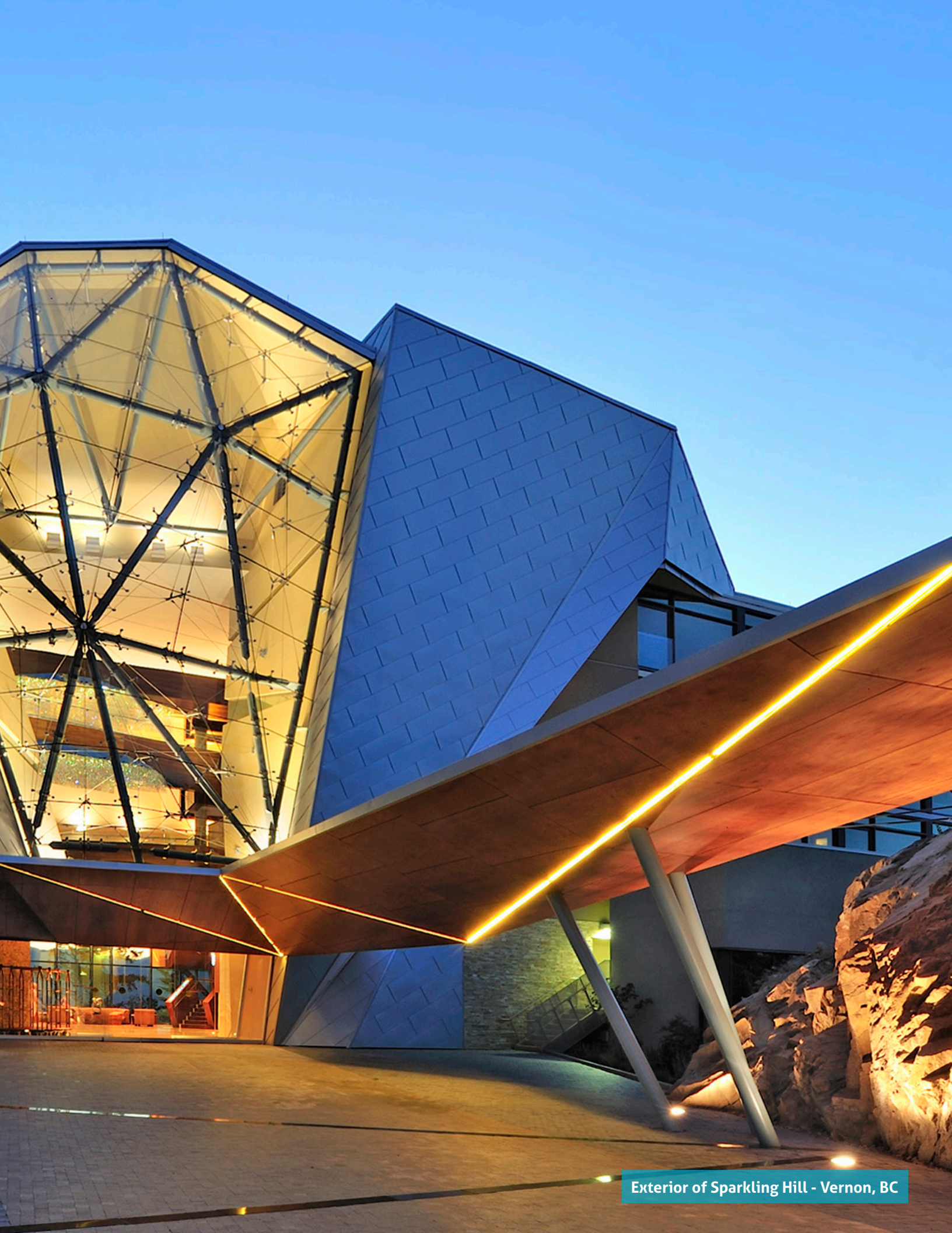
Exterior of Sparkling Hill - Vernon, BC