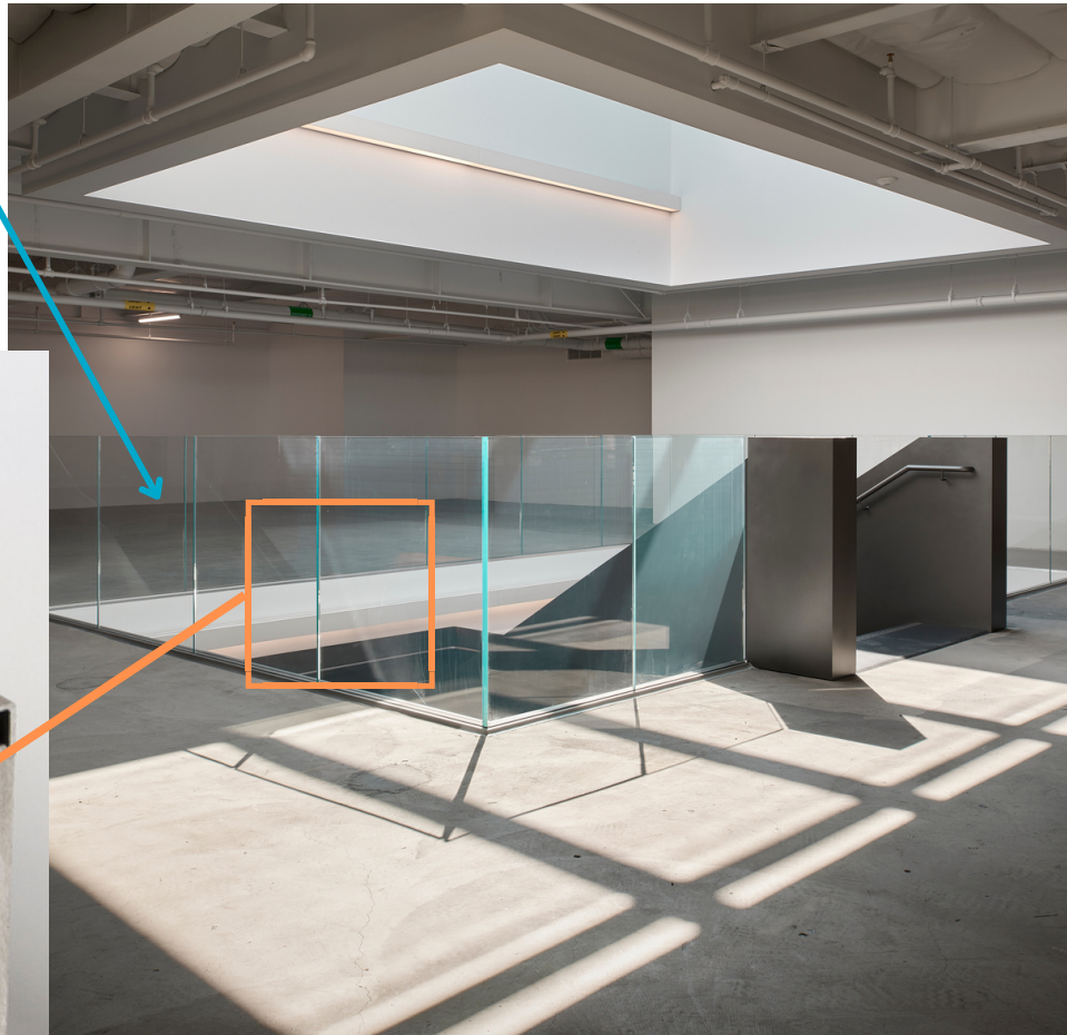
Beverly Hills Post - Photo copyright - Gensler/Ryan Gobuty.